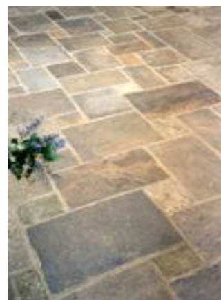
York Stone Paving