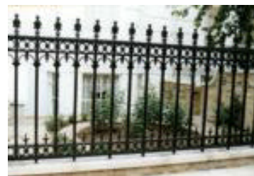
Custom built railings