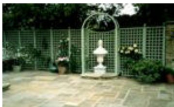
A Courtyard Garden

We do, of course, provide a maintenance service to keep your new or existing garden in a perfect condition. A visit and estimate is free, so contact us today and take your first step towards the garden you're always wanted.