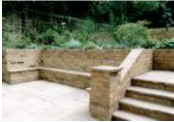
Terracing and steps linking linking basment and garden levels